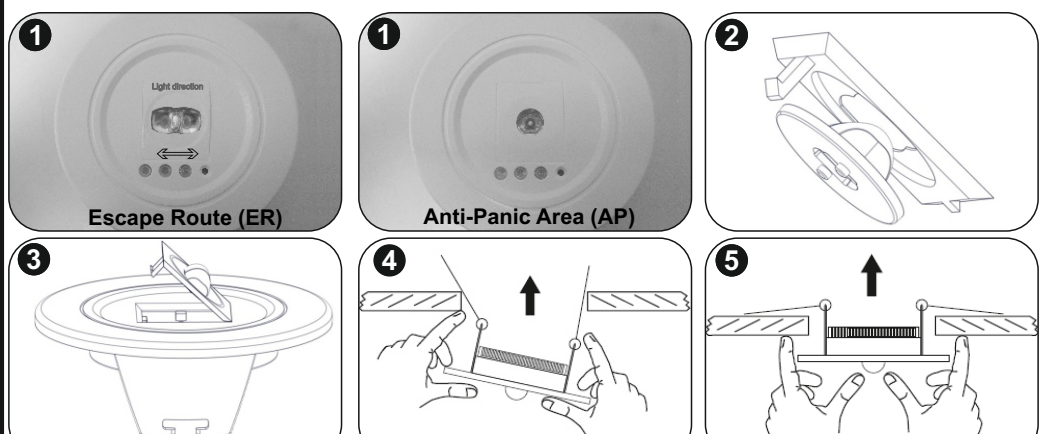
Step 1: In order to place the proper lens (Anti - panic or escape route), first be sure that the luminary is not connected in the mains power supply and the battery is disconnected. A 5 lux lens (Part no. 2900XX.STR) is also available for order. Use the corresponding lens retaining cover depending on the lens you will use.

Step 2: Put the lens on the retaining cover.